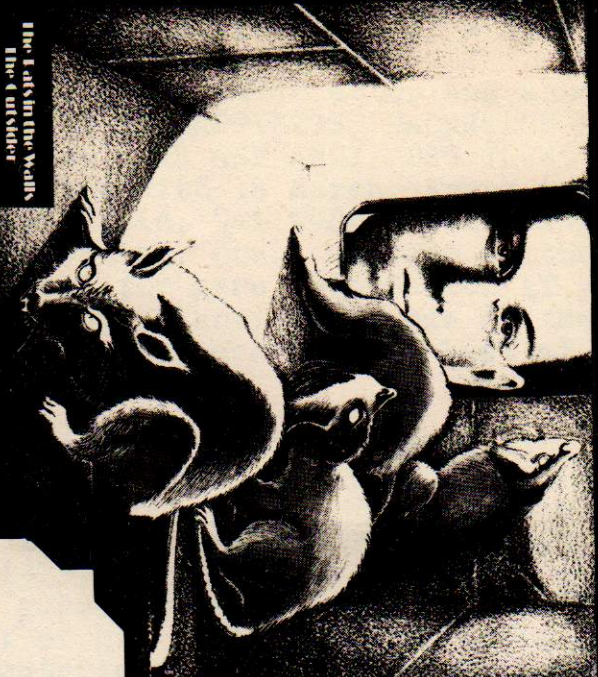
The Rats in the Walls The Outsider

Lava Mt. H.P. LOVECRAFT a limited edition of the best-selling author's most presiding