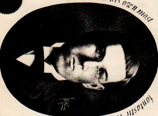
he was his own most

THE FIRST AUTHORIZED LP IN HISTORY DEVOTED EXCLUSIVELY TO HPL! NUMBERS 1-200 WILL BE SIGNED BY THE ARTISTS! LOVECRAFT IN STEREO! SUPERB QUALITY PRICE SIX DOLLARS & FIFTY CENTS POST. & INS.